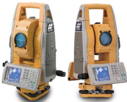
GPT-7500/GTS-750 Total Stations